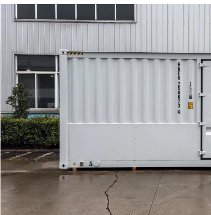
ABB central inverters PVS800 - 500 to 1000

Nov 29, 2025 · Introducing the 800kw Bidirectional Inverter for Solar Energy Storage by Jinan Deming Power Equipment Co., Ltd. This intelligent solar energy storage system is ...